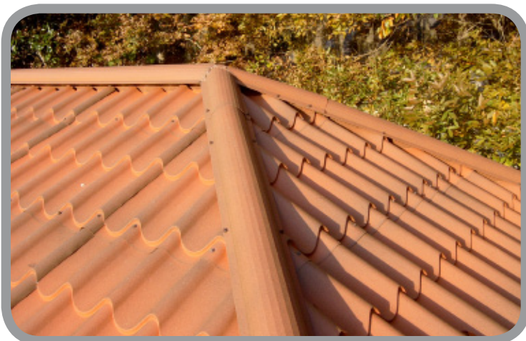
Through-Fastened Tile style Steel Roof

Through-fastened panels that utilize exposed fasteners are most common. In many cases, the exposed fastener is simply driven through an overlap between panels as well as through other strategic locations as specified by the roofing manufacturer. Exposed fastener systems are usually lesser-quality systems and therefore subject to lesser warranties than concealed fastener systems. The reason for this is that exposed fasteners are susceptible to the elements and tend to break down and fail much sooner than concealed-fastener panels. Exposed fasteners are normally self-drilling screws with a hex-head drive. These screws will typically have an oversized “cap” head protecting a neoprene washer for water tightness. The screws will normally be painted to match the roof system. Although the screws are self-drilling, most installers will pre-drill holes in the roofing from the backside to ensure proper placement. Over time, as the metal panels expand and contract, a great deal of pressure is put on through-fasteners, often wallowing out the holes in the panels or fatiguing the fasteners and causing them to back out or even break.