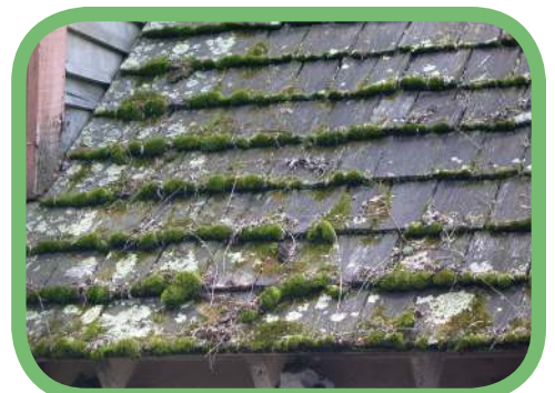
Wood Shake with moss growth

Tearing off the old roof will have detrimental effects on the homeowner's property. Pieces of wood, nails, and other debris litter the yard and neighborhood and, just like with standard shingles, the refuse must be deposited in a landfill.