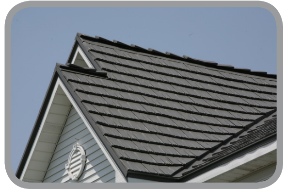
Shake profile Aluminum Roof

The growth in demand for standing seam in the residential roofing market over the past few years may be exceeded only by the growth in popularity of the “new metal roofs” – the shake, shingle, tile, and slate profiles. These products allow homeowners the opportunity to have the benefits of metal roofing along with the looks of something very traditional and timeless. The four different types of these “modular” panels can vary greatly in terms of look and use. Following is a description of all four.