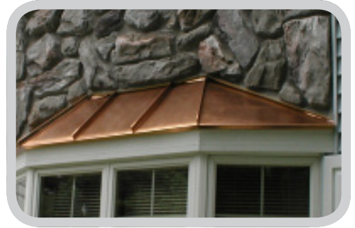
Copper Roof accent

Copper is generally recognized as one of the most attractive metal roofing options. Unfortunately, it carries a pretty hefty price tag. Copper is the most expensive of the three most popular roofing metals (steel, aluminum, copper – in increasing order of expense). Rarely used over an entire residential roof, copper is mainly used for accents over bay windows, dormers, or other areas where a touch of elegance is desired. Copper is used often on historic buildings, church steeples, cupolas, and the like. Copper is installed in short standing seam panels or sheeting, but there are some copper shingles available as well. Classic's Chateau Slate and Oxford Shingle are both available in copper and are ideal choices for the applications mentioned above.