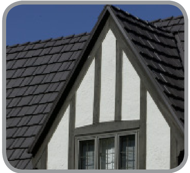
Above and Below: Aluminum Roof

There are other metals available for roofing as well including rolled zinc, stainless steel, terne-coated steel, terne-coated stainless, and titanium. Generally, roofs made from these more exotic metals will be architect-specified and will be custom-formed by a fabricator for a particular application. If you have interest in one of these more specialized metals, contact metal roofing manufacturers to check on availability and suitability for your end use.