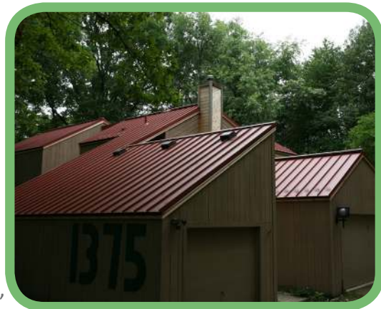
Standing Seam Aluminum Roof

Sheet metal roofing is available in many different profiles, all going by different names. “5V” Crimp, “R” Panel, corrugated roofing, face-fastened panels, through-fastened panels, or screw down panels are some of the synonyms for the style of metal roofing that is encompassed under the umbrella term “sheet.” Metal sheet roofing is manufactured primarily from galvalume or galvanized steel in thicknesses that vary between 24 and 30 gauge. The defining characteristic of all sheet roofing is large panels (or sheets) of varying widths and lengths that overlap and have exposed fasteners. The fasteners are driven through the overlapping portions of the panels, as well as in other strategic locations and into the roof decking, purlin, or spaced sheathing below. A neoprene washer is located beneath the head of the fastener to ensure water tightness.