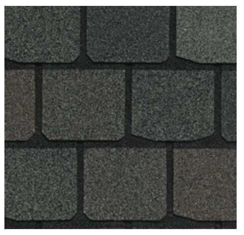
New England Slate